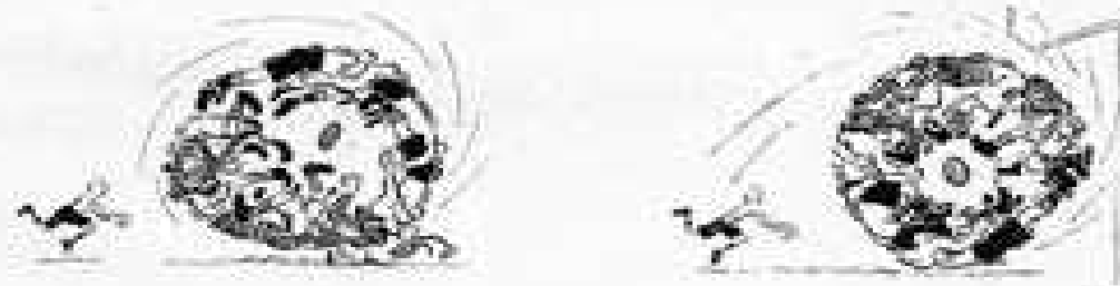
THROUGH THE GOAL-POSTS; OR, THE END OF A PERFECT SCRUM.